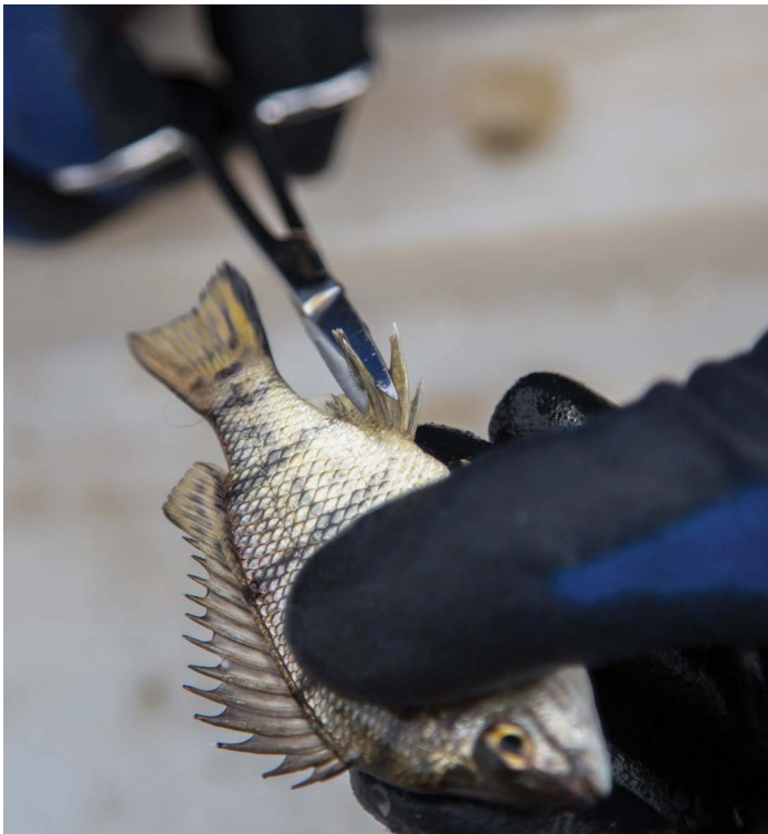
eDNA techniques are proving to have a wide range of applications in both marine and freshwater systems.