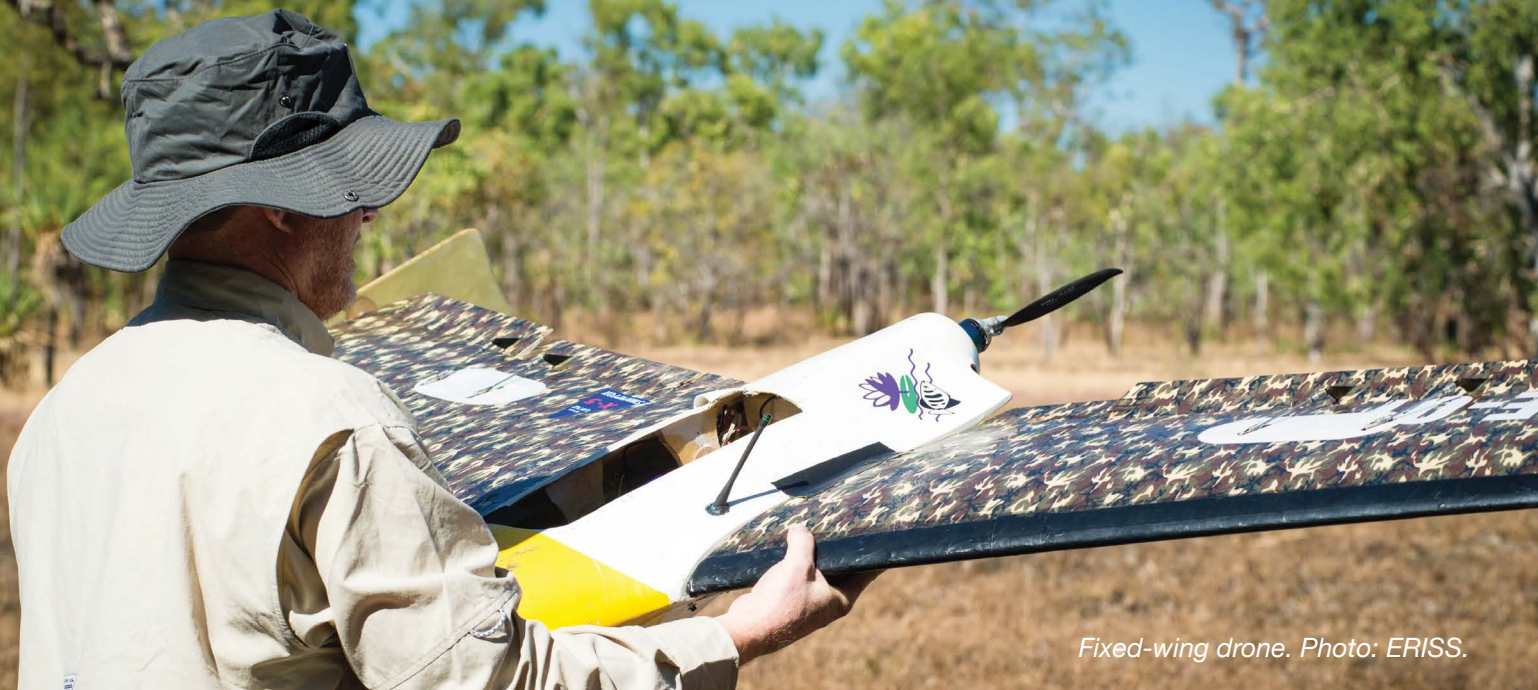
Fixed-wing drone.