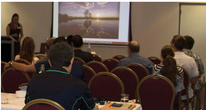
Emerging technologies were discussed at a workshop held in May 2016.

However, environmental monitoring in northern Australia is complicated by many resource and logistical constraints including the sheer size of the region, limited and variable site access (e.g. limited all-weather roads and infrastructure, wet season inaccessibility), environmental hazards to field-based studies (including crocodiles, cyclones and harsh climate), relatively small population base, and limitations on technical capability. These constraints often lead to restricted sampling designs, with limited sample sizes, reduced spatial coverage, and poor power to track environmental change, particularly in timeframes suitable for managers. A number of emerging technologies may mitigate these constraints and improve environmental monitoring, and these were the focus of this research.