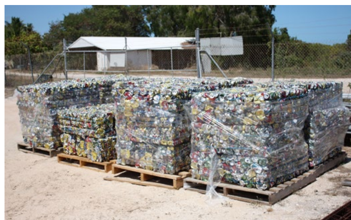
Best practices implemented in Pormpuraaw include crushing and baling aluminium cans prior to transfer, Pormpuraaw Aboriginal Shire.