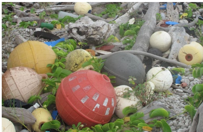
The amounts of marine debris on beaches can be extreme, photo © H. Taylor / Tangaroa Blue.