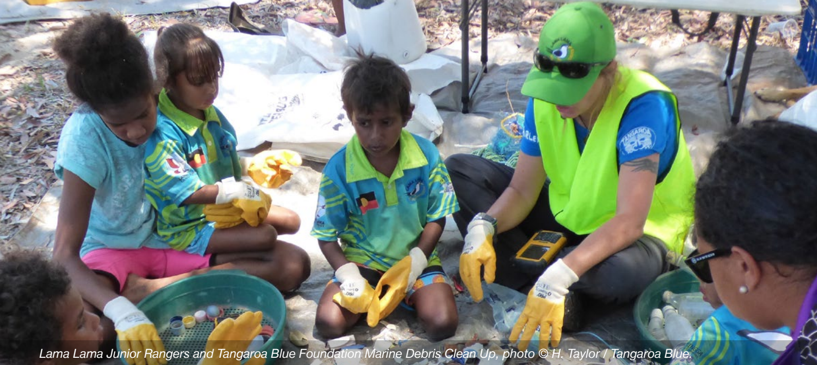
Lama Lama Junior Rangers and Tangaroa Blue Foundation Marine Debris Clean Up