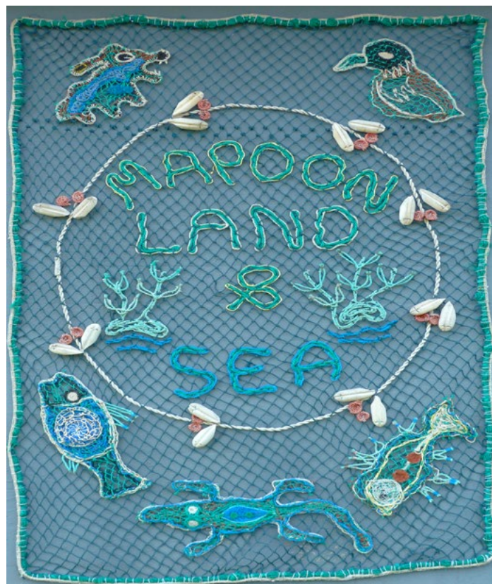
Recycled ghostnet hanging at Mapoon Land & Sea Centre, Mapoon