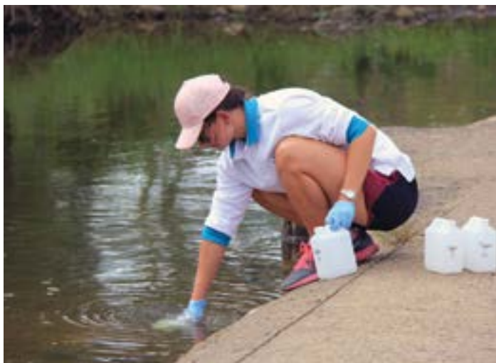
Surveying for aquatic species may be as simple as collecting a water sample.

In northern Australia, traditional techniques used to detect aquatic species can be difficult, labour-intensive and expensive due to factors such as remote locations, expansive geographic regions, limited and variable site access, and hazards such as crocodiles. To support sustainable development in the north, we need to better understand and keep track of the health of our rivers, creeks and waterholes and the plants and animals that live in them. A method that allows managers and researchers to overcome many of these challenges would therefore be greatly beneficial.