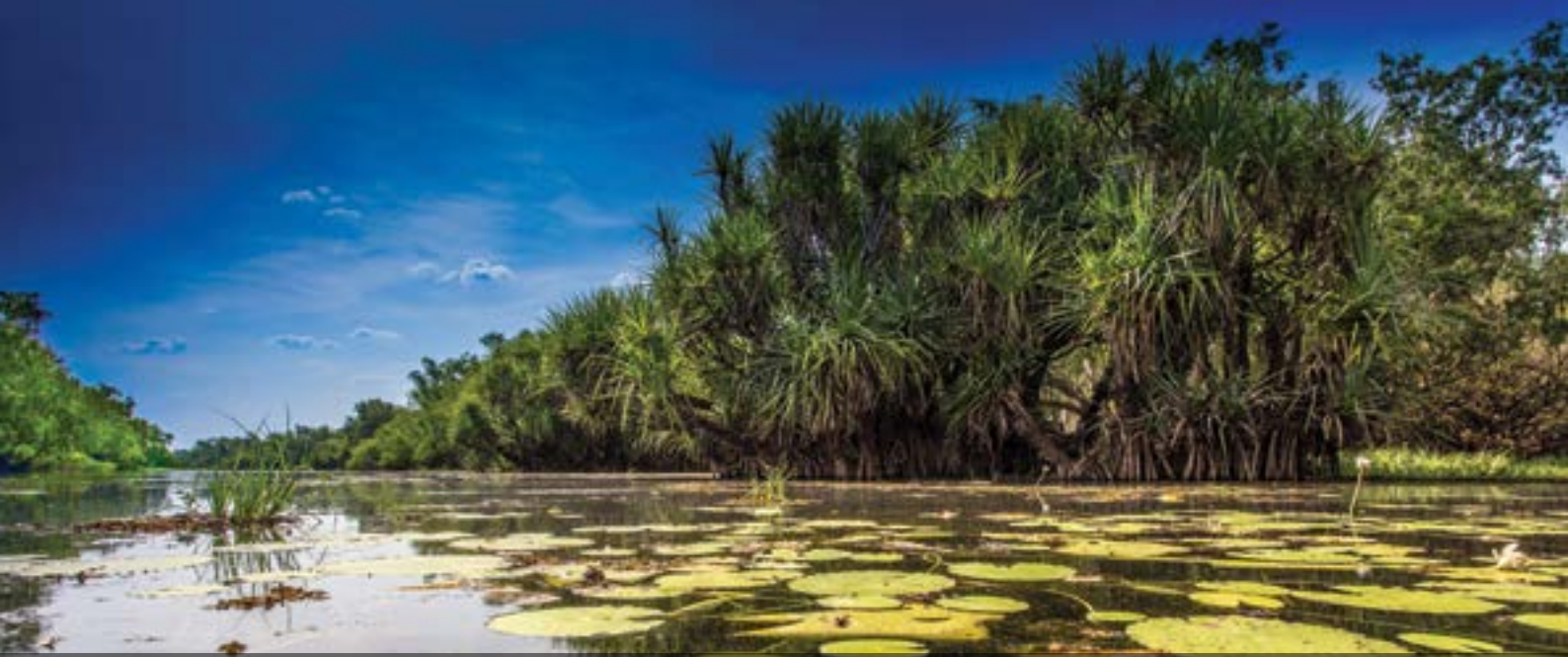
The eDNA method is an exciting new method for monitoring aquatic environments