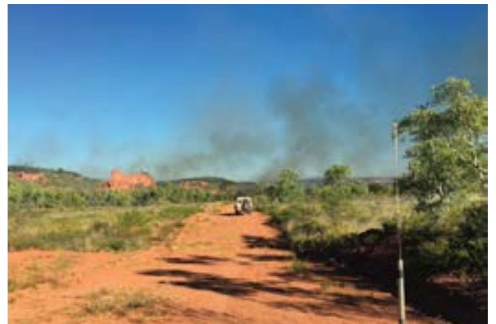
Burning Nicholson Block, Northern Territory, photo Northern Land Council.