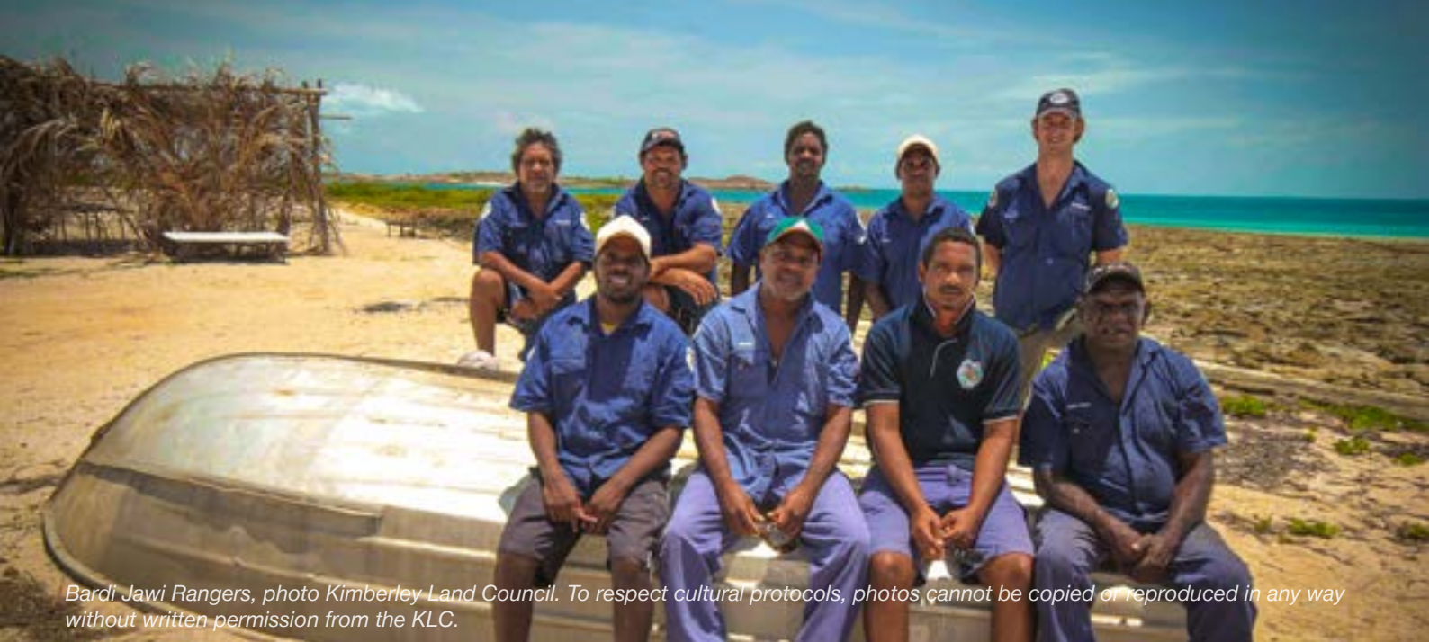
Bardi Jawi Rangers, To respect cultural protocols, photos cannot be copied or reproduced in any way without written permission from the KLC.