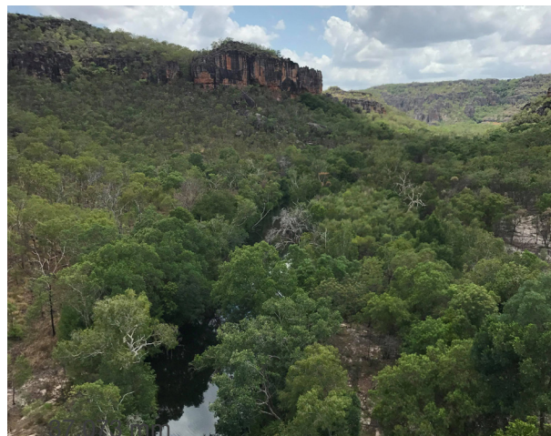
Magela Creek is in Kakadu and runs through the Ranger uranium mine lease