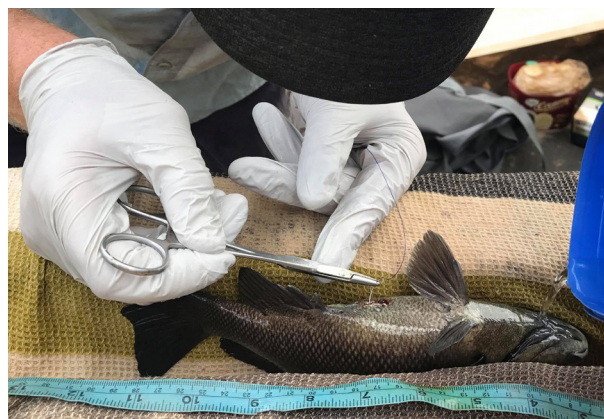
Tagging fish with acoustic tags is a precise task requiring patience and finesse, often in challenging field situations

This project focuses on Magela Creek, both upstream and downstream from Ranger uranium mine.