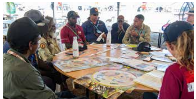
Land and sea rangers discussing the OKOW Guidelines at the NT Ranger Forum.